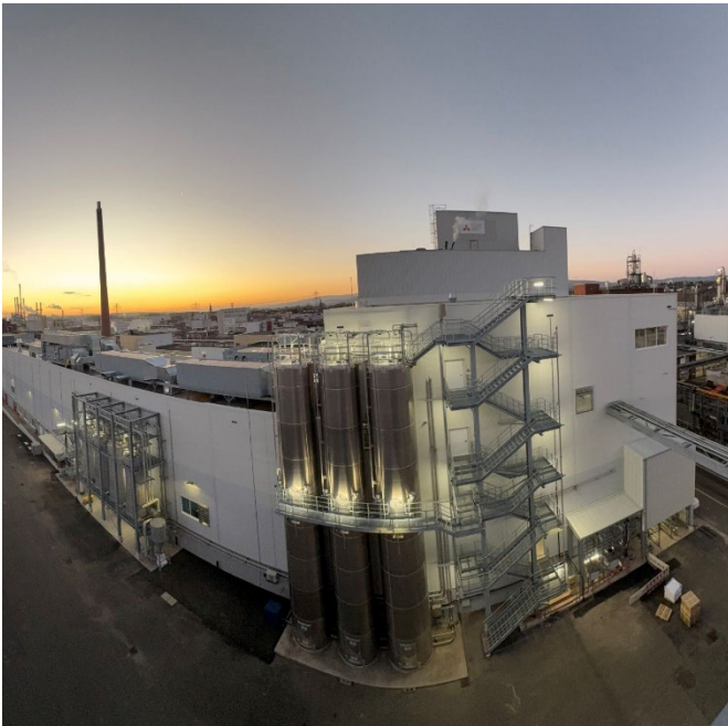
Production building of the new polyester film line in the industrial park in Wiesbaden